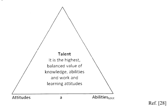
Figure 1. The significance of a talent

Yet, the relation between talent and competencies is undisputable, therefore, it is authorized to say that talent management equals the highest, balanced level of sets: attitudes, abilities and knowledge management. The assumption that talent management is a derivative of activities aimed to talent growth trajectory optimization to achieve organizational goals is well founded ( Figure 2).